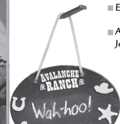
■ Empty Tomb! ■ Awesome Surprises Jesus Is Risen!