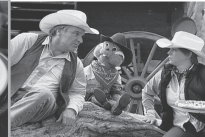
Will Snake succeed in stealing the herd?