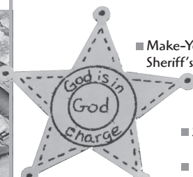
■ Make-Your-Own Sheriff's Badge