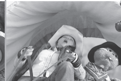
How will Chadder and Calamity Jean survive?