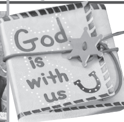
■ Prayer Journals