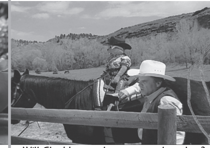
Will Chadder ever become a real cowboy?