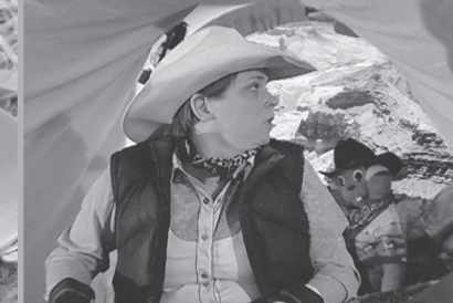
Did Buck fall over the cliff?