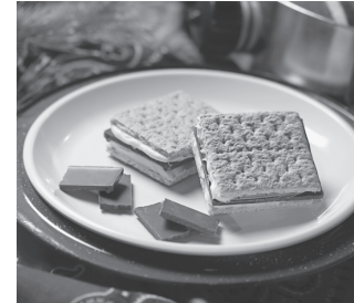
Stick With Us S'mores