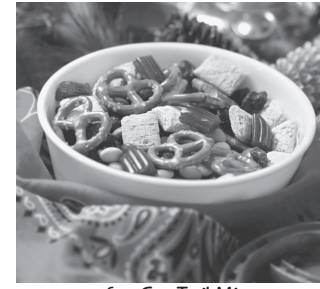
Spy Guy Trail Mix