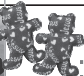
■ Operation Kid-to-Kid™ Prayer Bears