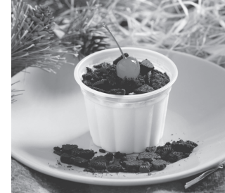
Awesome Avalanche Surprise