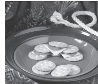
Tumbling Jericho Walls